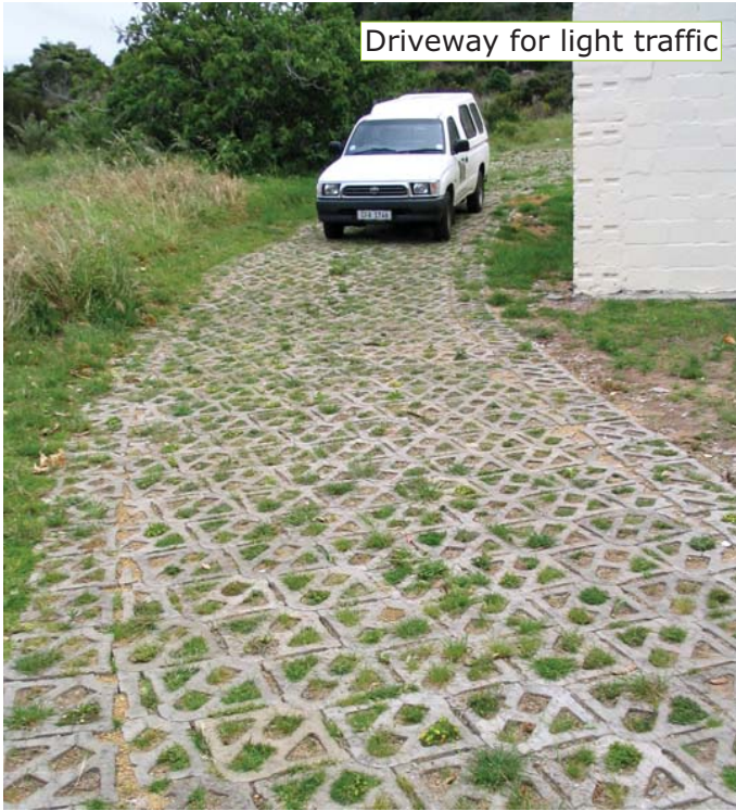
Driveway for light traffic

it to the ground beneath. Permeable surfaces have three main components: