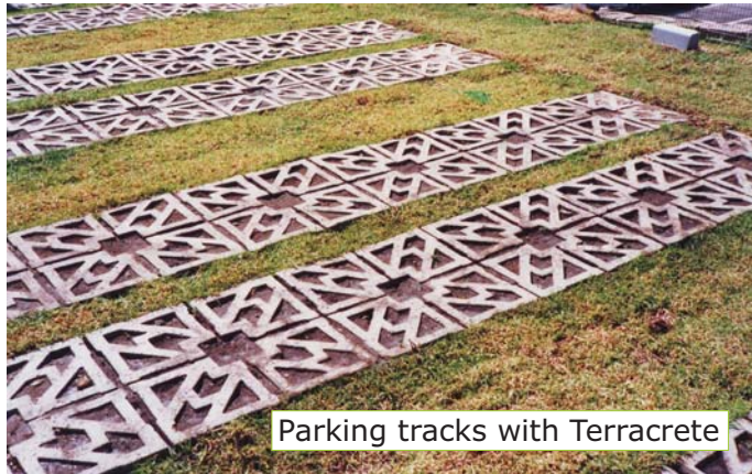
Parking tracks with Terracrete